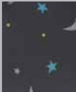
5" CONTOUR DEPTH-STANDARD